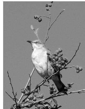
Northern Mockingbird, Arana Gulch

As with all Lifelong Learner classes, the cost of the class is $20. If more than ten people are interested in enrolling, we will establish a waiting list. To register, please mail the coupon below by October 1 st .