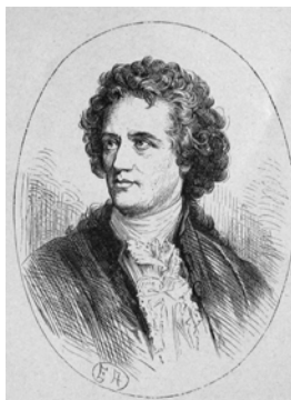
Johann Wolfgang von Goethe