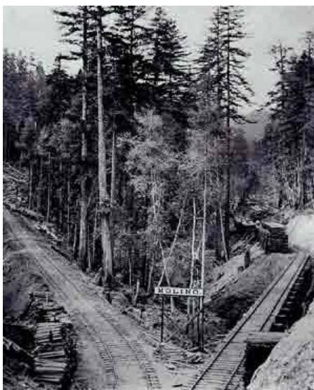
Historic Photo: Molina Timber Company Rail Line, location now in Nisene Marks State Forest