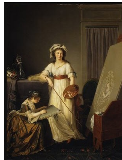
Atelier Of A Painter. Marie-Denise Villers