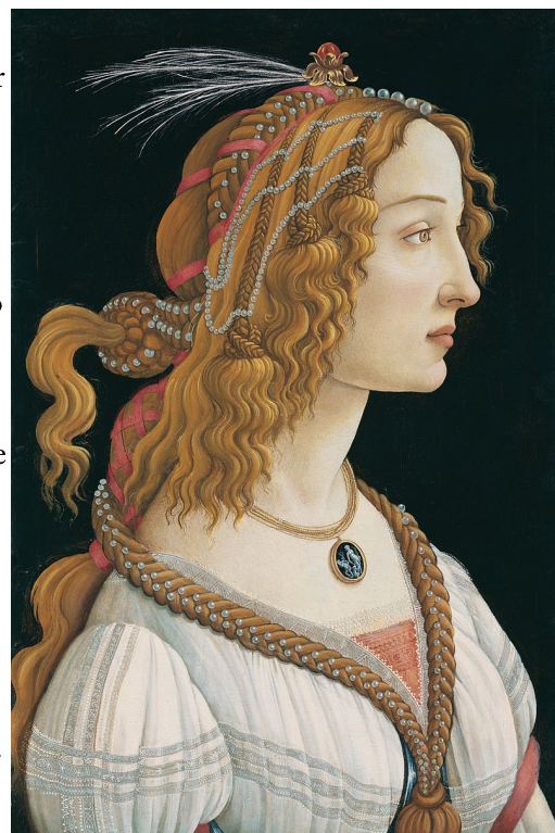
Portrait of a young woman. Sandro Botticelli

zation. In the 1970s she created the first Women in American History courses at American River College. We all found her to be a talented, well-prepared and knowledgeable teacher.