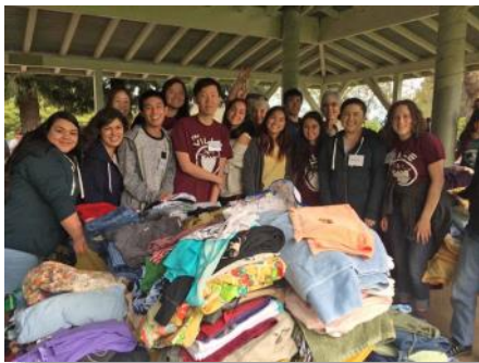
Flea market at ASB

My hope is this is just the beginning of OLLI/student collaborations. Stay tuned.