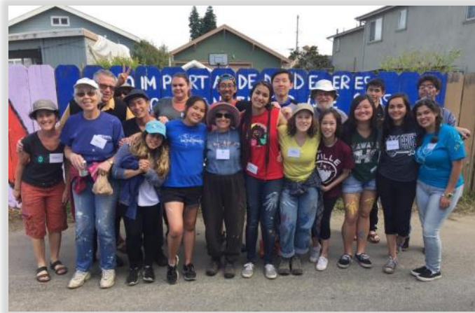
UCSC Students & OLLI