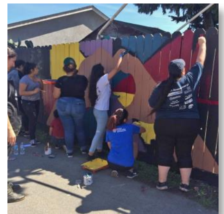
Painting the mural