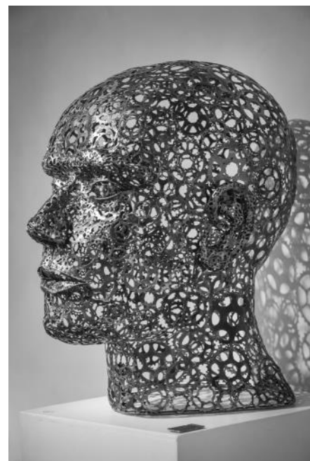
Art & Architecture tour, Blitzer Gallery.