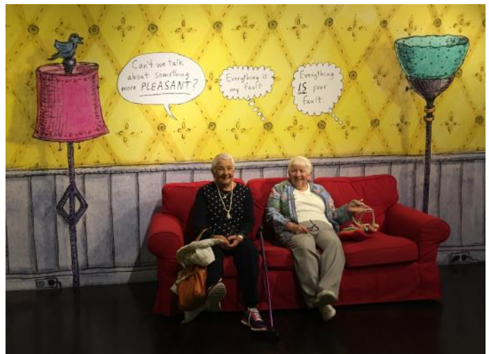
Roz Chast Exhibit, New Yorker Cartoon Artist Contemporary Jewish Museum in San Francisco Art & Architecture tour, August 21, 2017

See page 7 for additional photos of interest group events.