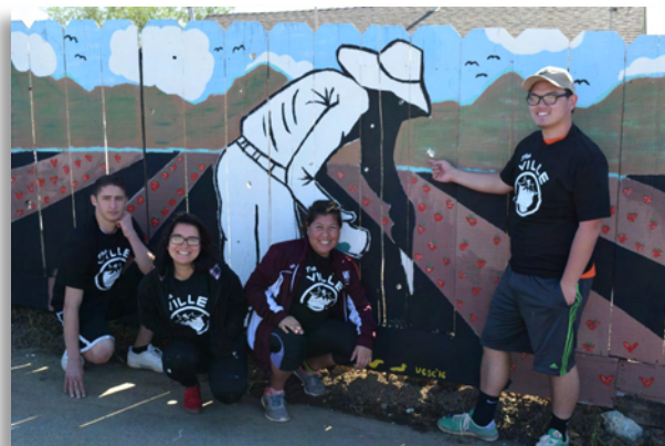
Mural, ASB, Spring 2018