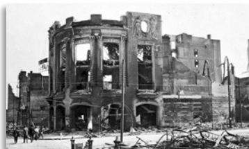
Tivoli Opera House Ruins, 1906

The quarter-century from the disastrous 1906 earthquake to the start of the Second World War saw the establishment of the major musical institutions we now think of as central to San