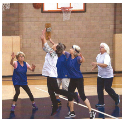
The team in action!