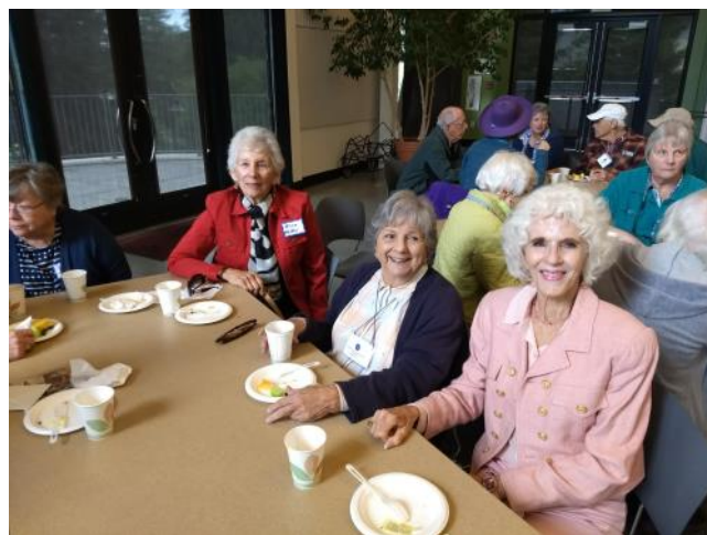
OLLI Members, May 2018 General Meeting