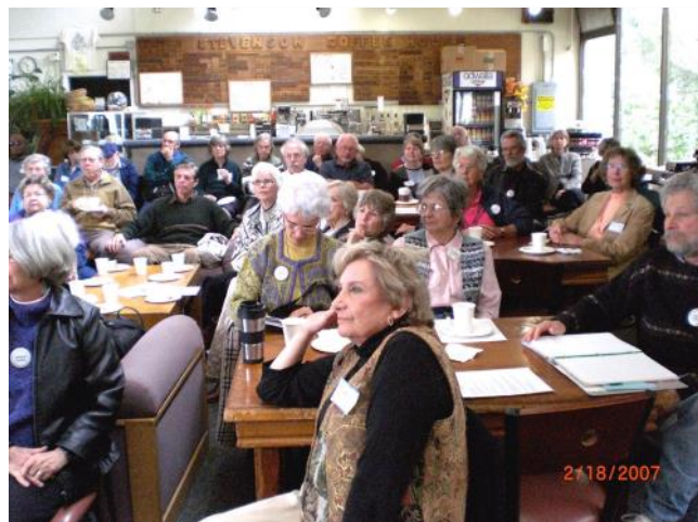
Sunday meeting at the Stevenson Coffee House, 2007