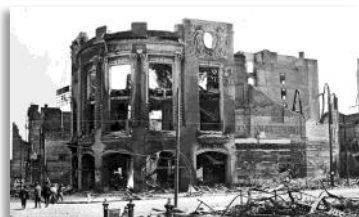
Tivoli Opera House Ruins, 1906

The quarter-century from the disastrous 1906 earthquake to the start of the Second World War saw the establishment of the major musical institutions we now think of as central to San