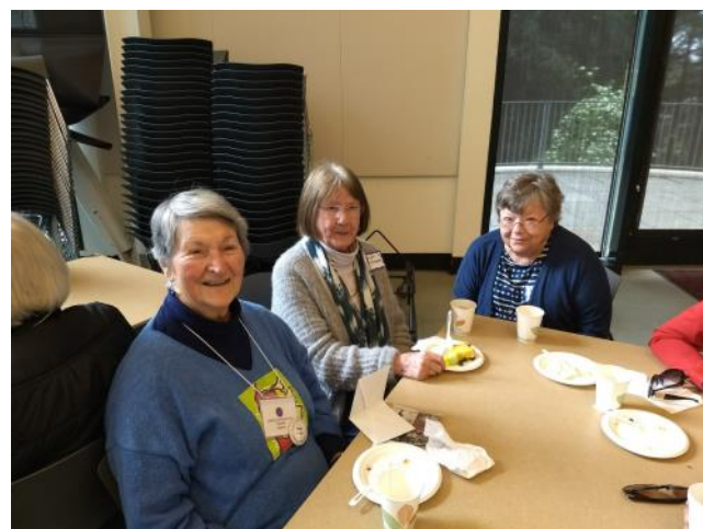
OLLI Members, May 2018 General Meeting