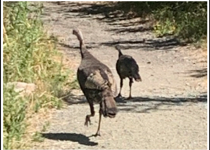
Chasing Turkeys at The Skyline Ridge Preserve above Palo Alto.