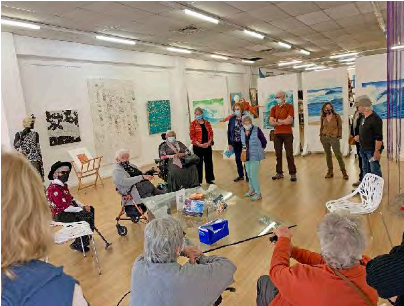
Art & Architecture Interest Group Curated by the Sea Art Gallery 703 Front Street, Santa Cruz November 12, 2021 First in-person meeting since the pandemic