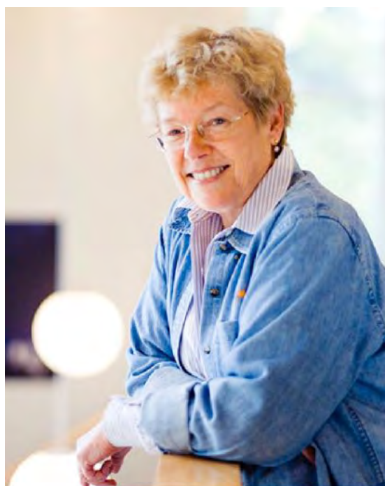
Sandra Faber, University Professor Emerita of Astronomy and Astrophysics at UCSC

Educated at Swarthmore College and Harvard, Professor Faber joined the faculty at UC Santa Cruz in 1972. In her highly productive career Professor Faber has made seminal contributions as both a theorist and as an astronomical observer. Her work has focused on the evolution of galaxies and the nature of dark matter. She played a major role in the development of the Keck telescopes in Hawaii and Hubble Space telescope. In recent years she has become concerned about the future of planet earth in the next millennium, and that will be the focus of her talk.