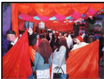
Trading Bazaar, Kashgar

DEJA VU: When we asked about the Taliban's brutal repression in Afghanistan, our well-educated guide's sobering response was: "Much of the fault lies with the West - particularly the United States." When Russia left, the US abruptly pulled out without first stabilizing the area; 1.5 million Afghanis died in the ensuing civil war. The eventual Taliban leaders, according to our guide, were reactionary Islamic students, uneducated but for religion, and had little concept of their country's history and culture and no interest in a viable nation state; their sole aim was to create the world's purest Islamic country. [20 years later, history repeats itself.]