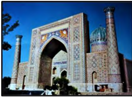
Bib-Khanym Mosque, Samarkand

MODERN CARAVAN: Central Asia isn't easy for independent travelers because of security issues - and little English is spoken. So, although we vastly prefer traveling on our own, we took a 3-week tour with ElderTreks* along part of the Old Silk Road. The 12 of us travelers and our two guides rode in a small bus - a modern-day camel caravan!