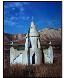
Muslim Tomb Kyrgyzstan

ARMED GUARDS: From Islamabad, Pakistan, our small bus went up to famed Khyber Pass (with two armed guards for protection) and we peered down into mountainous Afghanistan, through which 75% of the world's heroin was smuggled (in 2000).