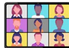
Only via Zoom?