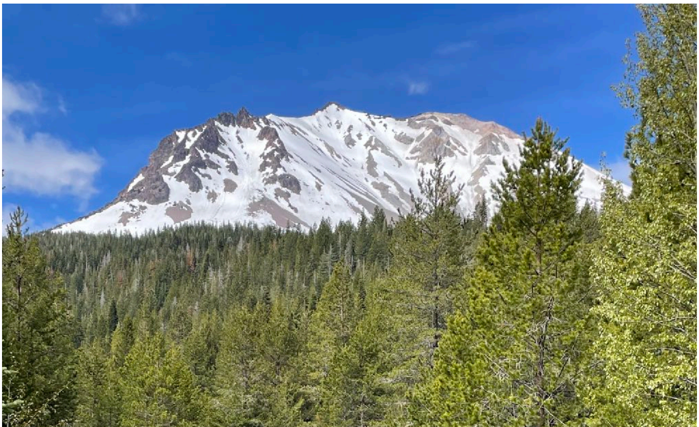
MOUNT LASSEN IN THE SPRING

Click here to see videos of past courses and commentaries on YouTube!