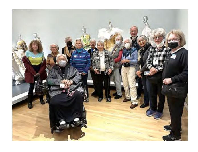
Art & Architechture Interest Group